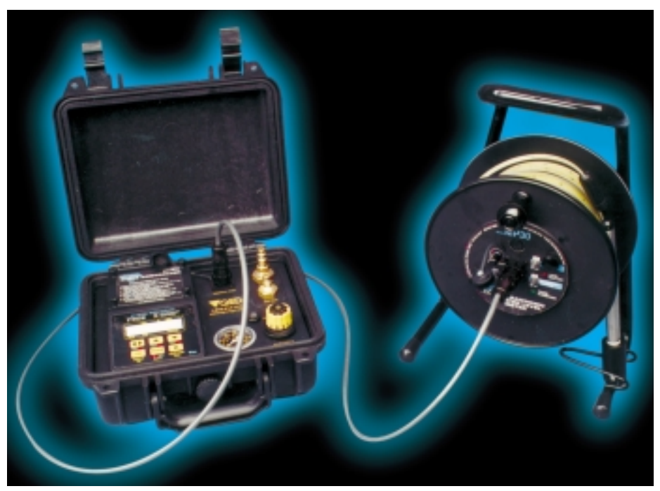
The MP30 (right) links to the MP10 or MP15 basics Controllers to provide continuous control of well level during low-flow purging and sampling. If the preset maximum drawdown level is reached, the MP30 signals the controller to put pumping on standby mode until the well level recovers.

If drawdown reaches the probe, the level shutoff light and buzzer are activated. The linked controller halts pump cycling until the well recovers and reaches the probe; then pumping resumes automatically.